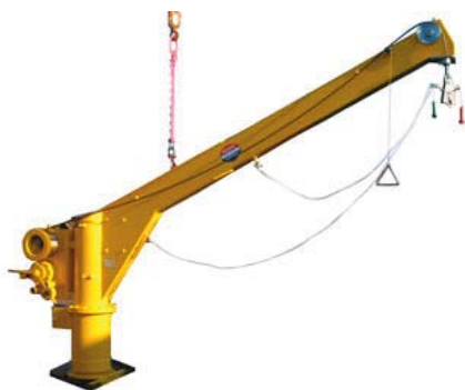
Liferaft davit SCM 21-4,0 L