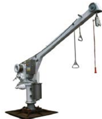
Combi davit SCH 14/12-3,5 LR