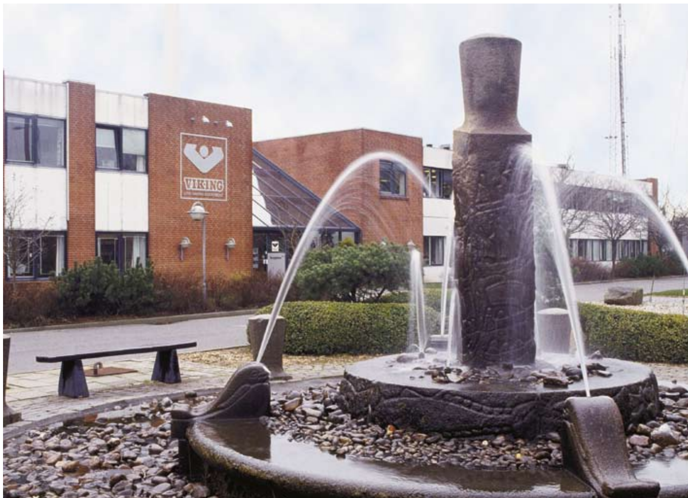
Our international headquarters in Denmark