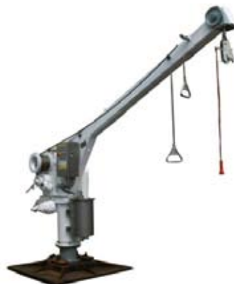
Rescue boat davit SCH 12-3,5 R