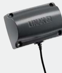
MD1 massage motor