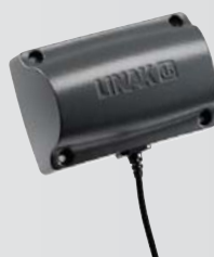
MD1 massage motor