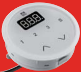
DPT Desk Panel