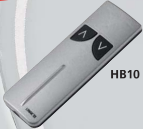
HB10 RF handset