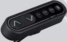
DPF1M Desk Panel