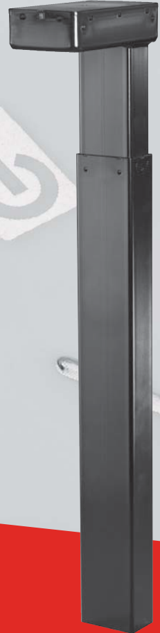
DL5 Lifting column