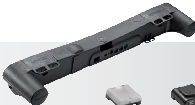
TD3 dual actuator

The TD3 TWINDRIVE® system is the most complete and modular system for leisure beds available on the market. Especially developed to comply with the need for more force in beds and adding more value on the bed for the end-user.