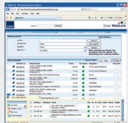
Example: WebLink OCI & iProcurement ordering basket