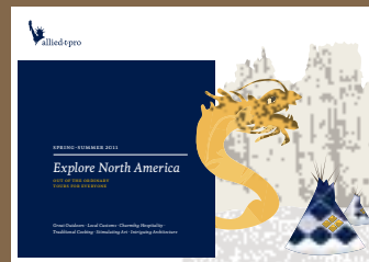
Explore North America